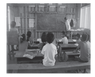
▲ Various classes inside the classrooms of DOP Sinakungan Indigenous Peoples' School

The Tribal Education Council (TEC) remains a key factor in programme implementation. As it contributes to the children's learning through weekly culture-sharing, a more regular transfer of indigenous knowledge between old and young is facilitated, and also a deeper appreciation for the indigenous Higaonon's own unique heritage. Engaging community elders as identified leaders for the TEC has also been effective in making sure all programme efforts are still aligned with what the Higaonon envisions for themselves.