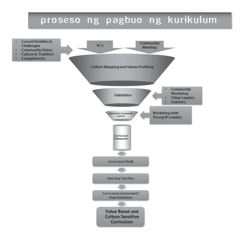
Figure 1. Curriculum development process for the learners of the ECEE programme

Cartwheel Foundation's entry point in the community always starts with a community meeting. It is a dialogue between the community members and Cartwheel representatives. During this dialogue, Cartwheel tries to observe and listen to the concerns and issues in the community. After that, a 4C's Workshop is scheduled. This is a workshop that tries to map out the community's Culture and Tradition, Current Realities, Competencies, and Community Vision.