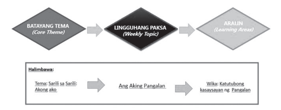
Figure 3. Lesson planning process for the learners of the ECEE Programme

The curriculum framework has the ancestral domain as the center of indigenous knowledge, skills, and practices. The indigenous peoples' lives are rooted to their land. Thus, the indigenous world views and beliefs, value systems, culture, arts and traditions, history, people and structures, realities and challenges, livelihood, and aspirations are connected with one another through the ancestral domain as the heart of indigenous peoples' lives and learning.