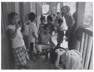
▲ Some of the learners' school activities include morning assemblies (left) and the feeding programme where volunteer-parents lend a hand in meal preparation and distribution (right)