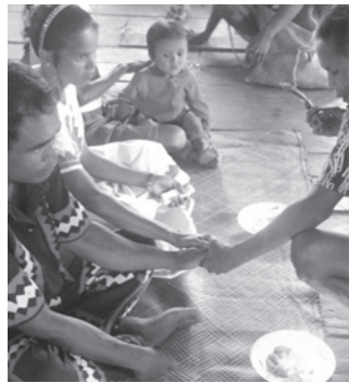
▲ Some of the rituals performed by the Higaonon elders involve the sharing of pig's meat (left) and uniting man and woman as married couple.

The Early Childhood and Elementary Education (ECEE) Programme focuses on facilitating access to quality and culturally-relevant early childhood and elementary education for the Higaonon indigenous children of Sinakungan, Esperanza, Agusan del Sur. Quality is achieved by ensuring that teachers are equipped with the right skills and methods, whereas cultural relevance comes with the indigenization of curriculum. The ultimate goal is to see the existing schools being run independently by proactive members of the partner communities.