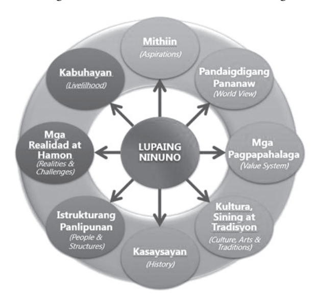
Figure 2. Curriculum framework for the learners of the ECEE Programme

The Indigenized Curriculum is the product of the processes that Cartwheel has been through together with the partner communities, elders, learners, Cartwheel grantees, and para-teachers. It follows the Department of Education's competencies and integrates the culture and values of the indigenous peoples.