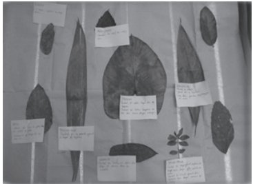
▲ Around classroom walls are objects sourced from around the community: an alphabet wall with real objects and its corresponding names (left) and a leaf chart complete with descriptions (right)