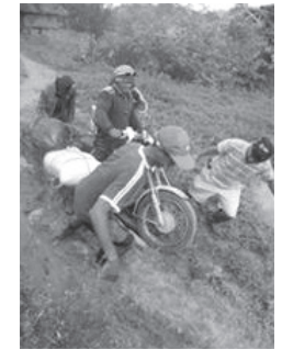
▲ Travelling to the Higaonon community in Sinakungan requires more than a day wherein one hikes through the mountains on foot, crosses a river on boat, and rides through muddy highlands on a motorbike loaded with supplies