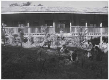
▲ The Higaonon of Sinakungan attend a community meeting at their tribunal (left), while many others take part in "Brigada Eskwela" where they clean up around the school before the opening of classes (right)