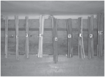
▲ Materials for Mathematics are counting sticks from bamboo (left) and twigs from trees (right)