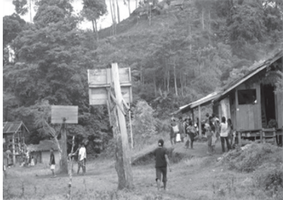
▲ Houses in the mountain community of Sinakungan are mostly made of wood sourced from the forests of which they are part

The specific activities integral in the implementation of ECEE programme are outlined below: