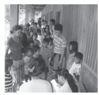
▲ Activities in preparing for classes are teachers' trainings (left) and enlisting for enrolment (right)