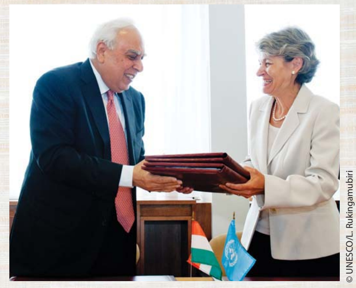
Minister Kapil Sibal (India) and UNESCO's Director-General, Irina Bokova, at the signature of the agreement establishing the Mahatma Gandhi Institute of Education for Peace and Sustainable Development, July 2012.

approaches to education, empowering learners to transform their lives and build a more peaceful and sustainable world.