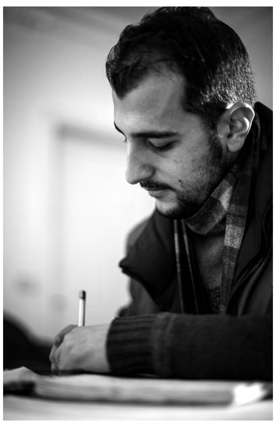
A Syrian refugee student studies at home in the Jordanian town of Irbid.