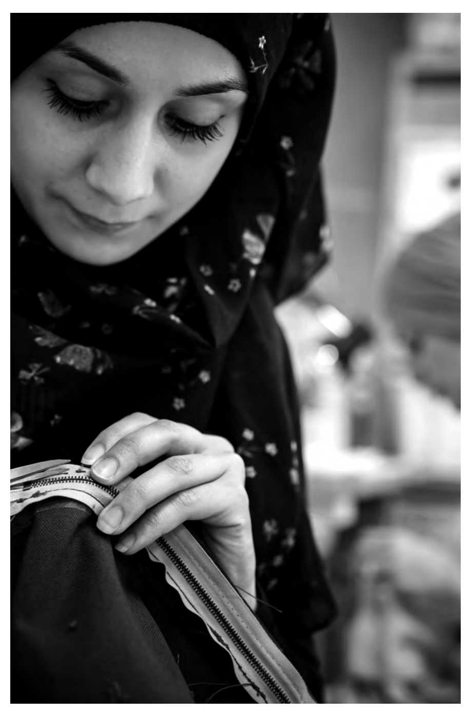
A young Syrian refugee taking part in a textiles workshop.