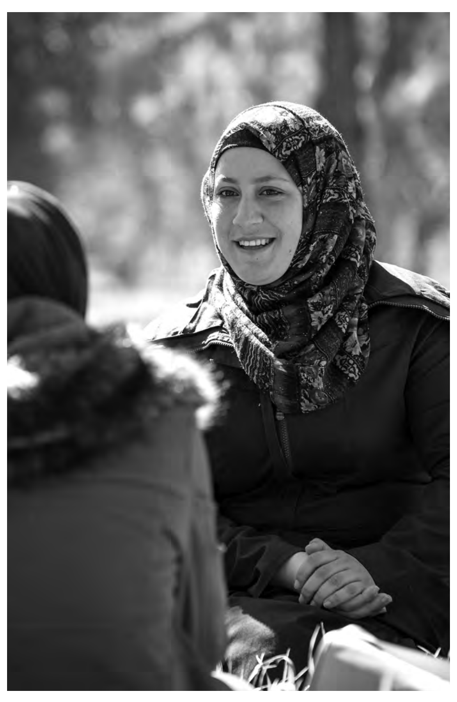
Syrian refugee studying at Al-Albayt University in Jordan \, \