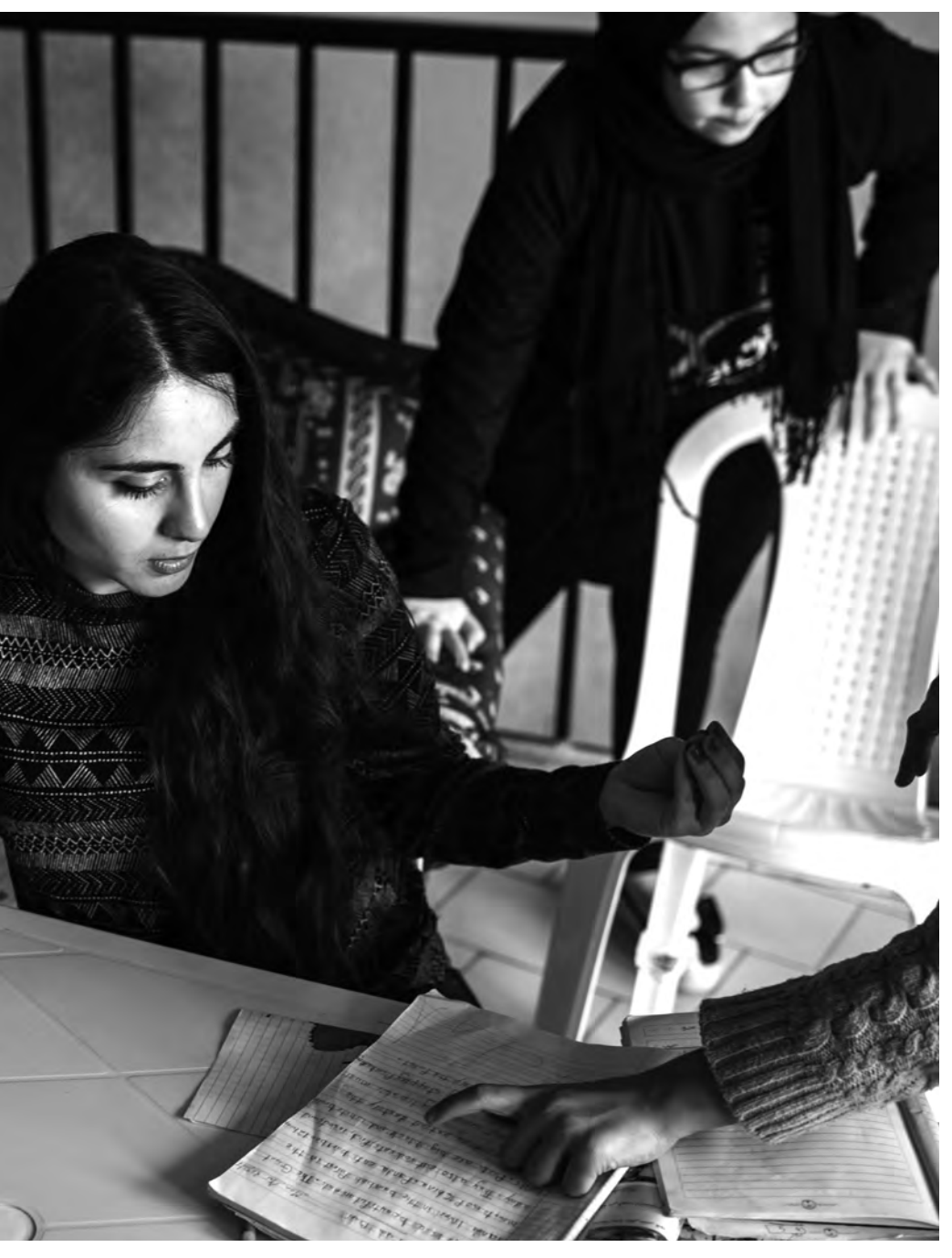
Homework\ club\ for\ Syrian\ schoolchildren\ in\ a\ makeshift\ school\ in\ the\ coastal\ city\ of\ Saida,\ Lebanon.\