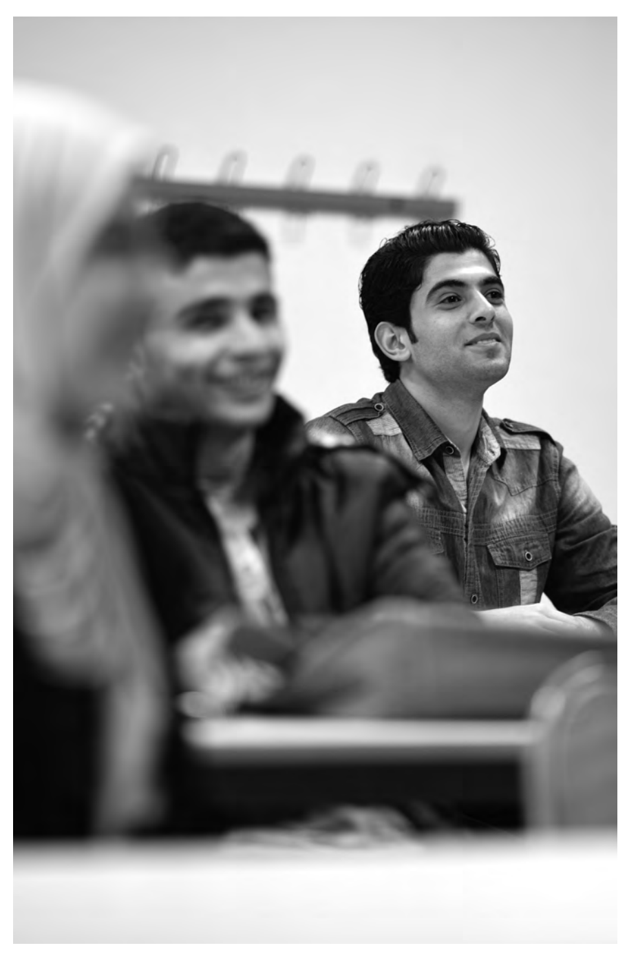
Young Syrian refugee students return to the classroom.